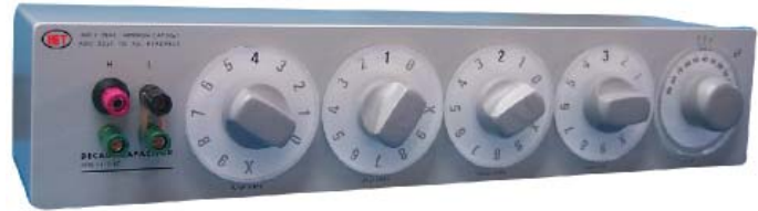
Model 1412-BC Decade Capacitor

Model 1412-BC: The wide capacitance range and high resolution of this decade capacitance box make it exceptionally useful in both laboratory and test shop. Owing to its fine adjustment of capacitance, it is a convenient variable capacitor to use with an impedance comparator. The polystyrene dielectric used in the decade steps is necessary for applications requiring low dielectric absorption and constancy of both capacitance and dissipation factor with frequency.