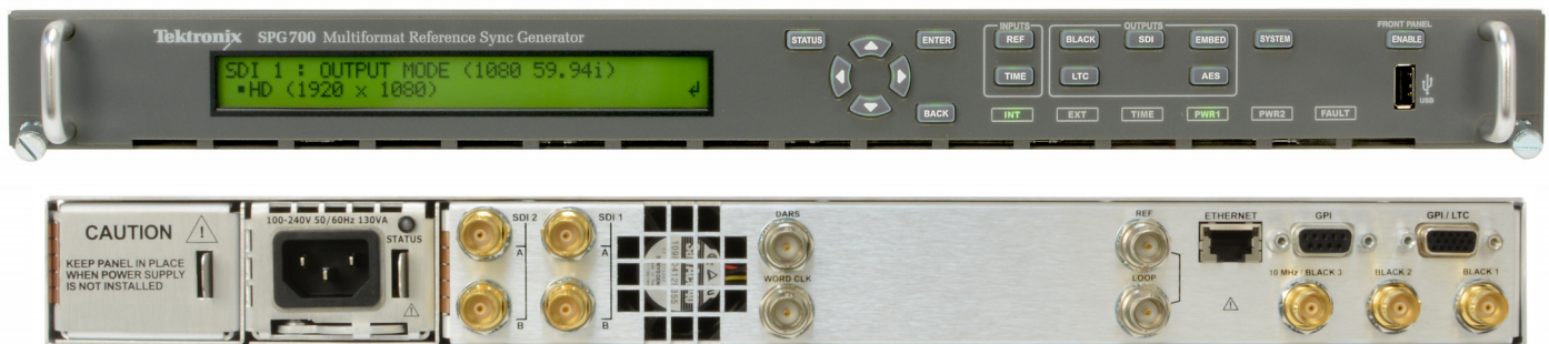
SPG700 Multiformat Reference Sync Generator front panel and back panel.

Time reference outputs are available in multiple formats. Three independent linear time code (LTC) outputs are available, and a fourth LTC connection can be used as input or output. Each LTC output has independent frame rate selection, time source (time-of-day or program time) and time zone offset. Vertical interval time code (VITC) is available on each NTSC or PAL black output, also with independent time sources and offsets.