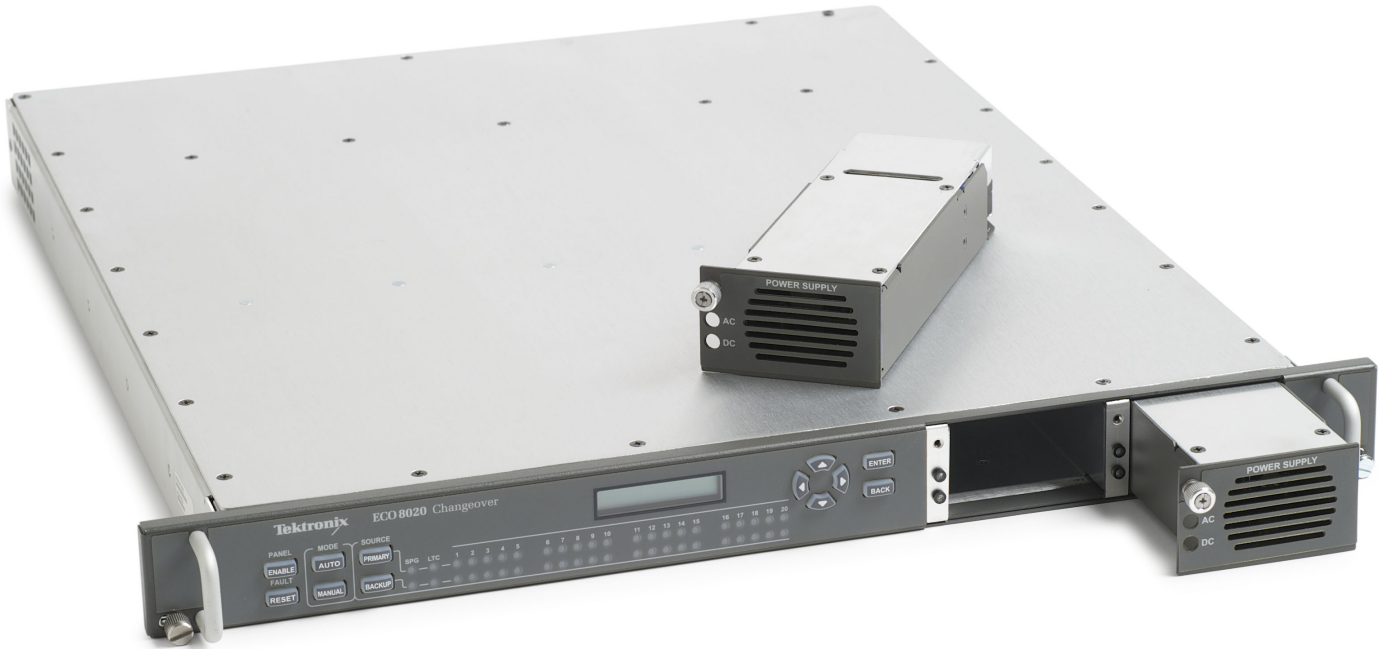
Option DPW backup power supply