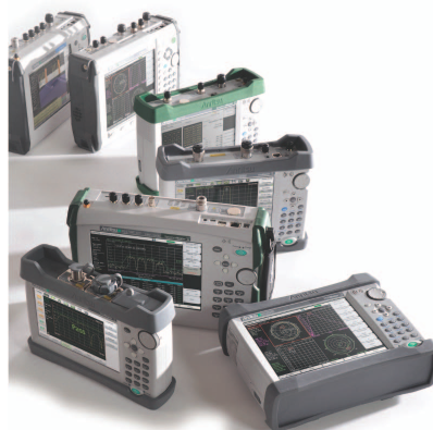
Anritsu handheld instruments

The MA8100A also provides end users with centralized access to all of the location information that has been logged via the included Cloud Service. Users can easily access previously saved building maps and measurement results anywhere with internet access.