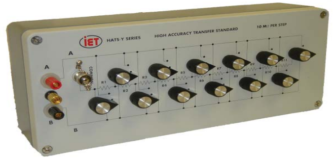
10 MΩ HATS-Y Transfer Standard

If one has a single standard that is calibrated by a national laboratory, one can then compare the transfer standards to the certified standard by ratio techniques. See p. 5 for a full tutorial.