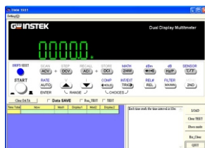
General Control Mode