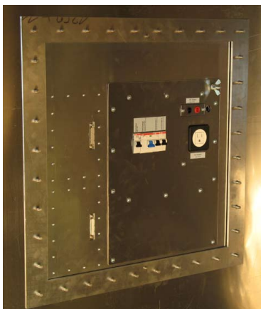
Option EUT BOX-1, DC1 and 2x SIF RC, view from inside