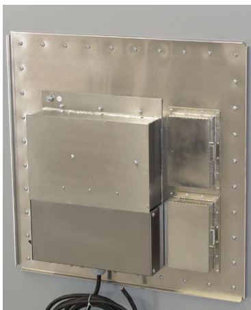
Option EUT BOX-1, DC1 and 2x SIF RC, view from outside