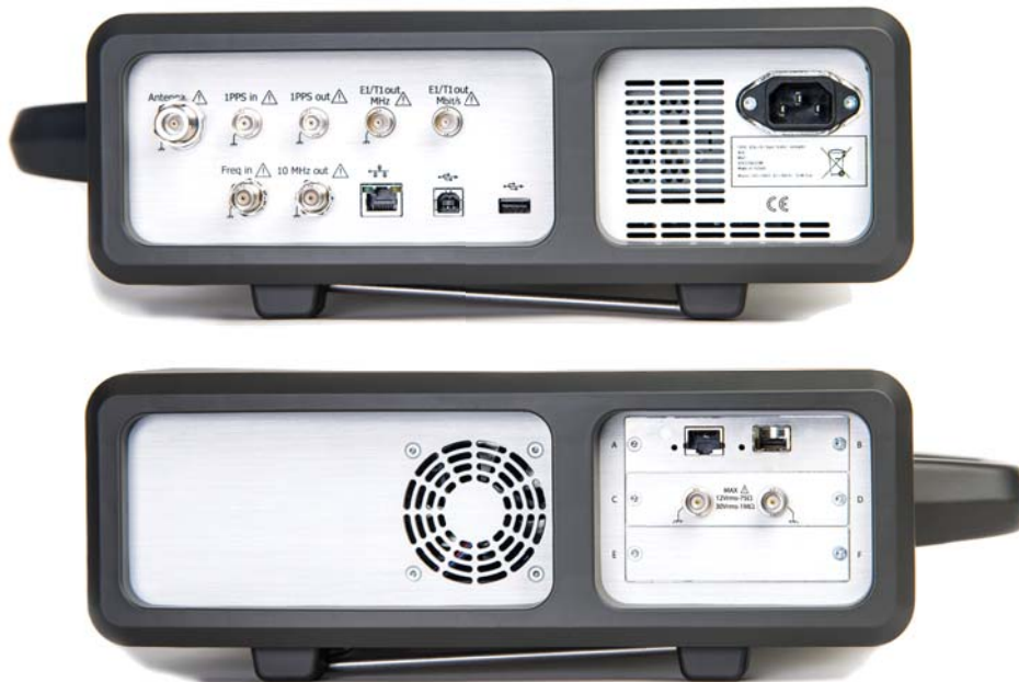
STA-61 side panels