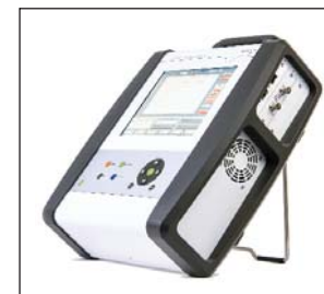
Shown with stand

The Pendulum STA-61 marks a new generation of instruments allowing the user to test and analyze synchronization quality and compliance in various types of networks. Where traditional instruments on the market are designed specifically for SDH/SONET or are dedicated SyncE or PTP testers, the STA-61 can do it all. This is a Sync Tester/Analyzer developed for Next Generation Networks (NGN), incorporating a mix of both traditional SDH/SONET core networks and IP-based backhaul networks.