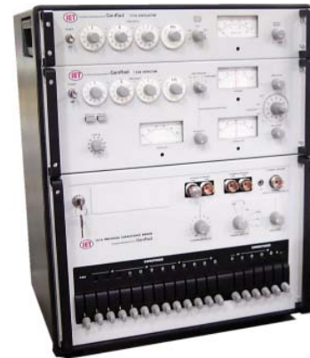
Model 1621 Precision Capacitance Measurement System

* National stock numbers are listed on the back of the catalog.