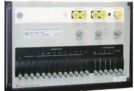
Model 1616 Precision Capacitance Bridge

For thermal stability in precision intercomparisons, eight of the twelve internal capacitance standards are mounted in an insulated compartment to reduce the effects of ambient temperature changes. Misreading the values at balance is virtually impossible due to direct-reading lever switches that control the balance for both capacitance and conductance. Panel layout is unusually neat—only the unknown capacitor and, if desired, and external standard for comparison measurements are connected to the front panel; the oscillator and detector are connected to the rear as are the BCD data-output channels.