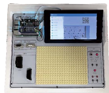
KL-82001 HMI Platform for CAN BUS