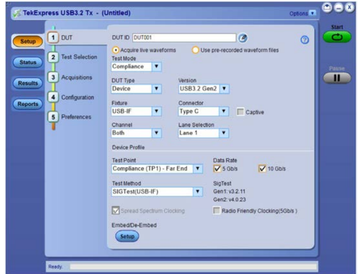
TekExpress automated framework configuration panel

Required test procedures (MOI) can be found at: www.tek.com/usb .